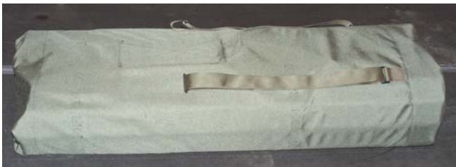
1942TA Pack Bag

*Roof Top Weight excludes ballast Kevlar® is a Registered Trademark of DuPont